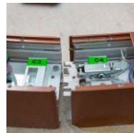
Spring Clip Joiner

LXX = ~ 63 LPW Delivered Lumens (Example: L144= 144W x 63LPW = 9,072 Lumens)